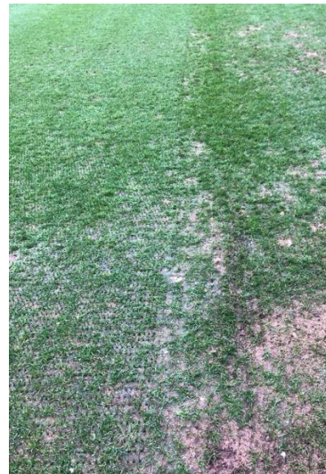
Example of the installation process and an example of the SoL pitch